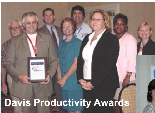
Davis Productivity Awards