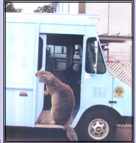
Chippy The Squirrel