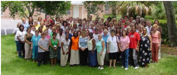
School Health Team