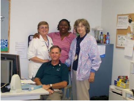
BCHD Immunization Team