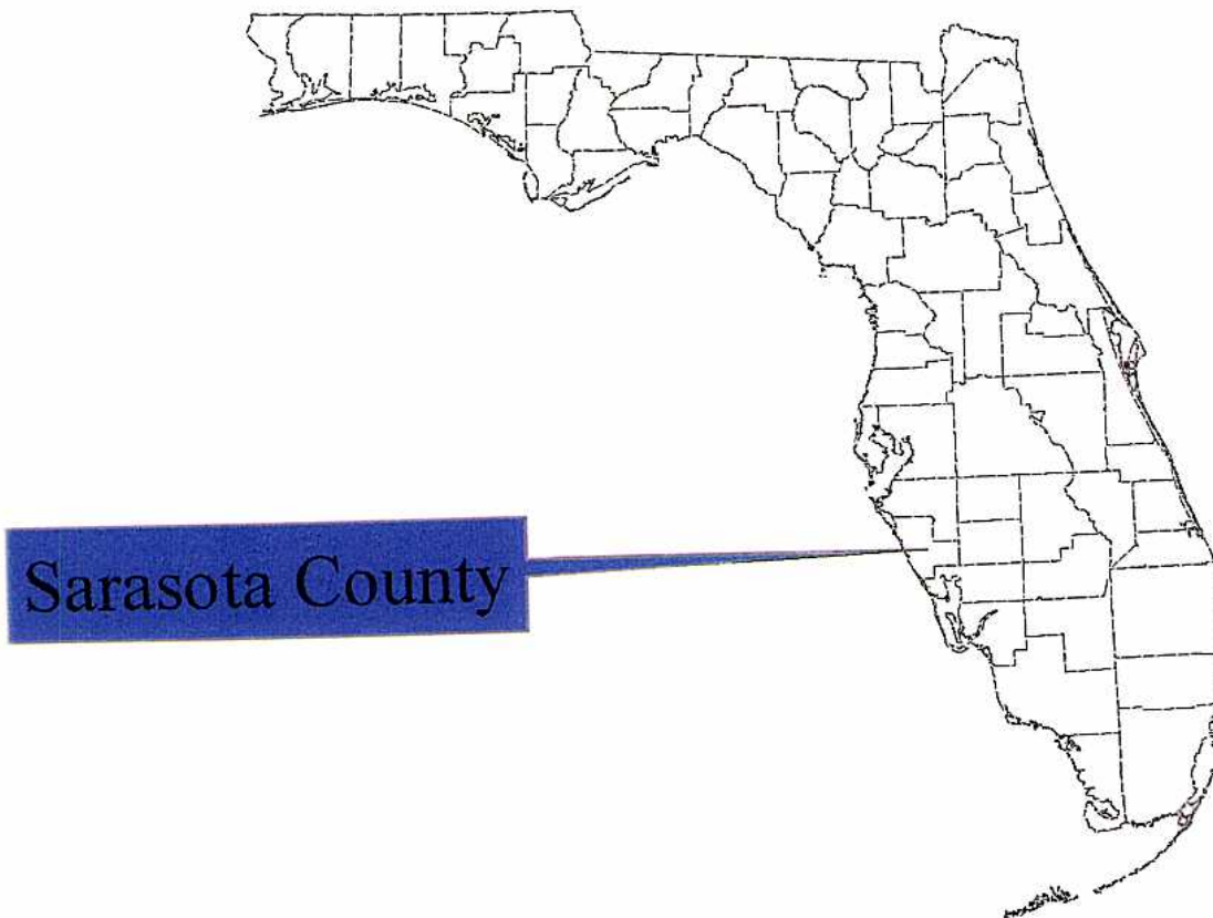
FIGURE 1 Sarasota Mercury Spill